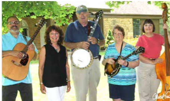
The Backroom String Band will perform outside during the lunch hour